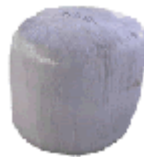
Si-role® (trademark registration 5089491)